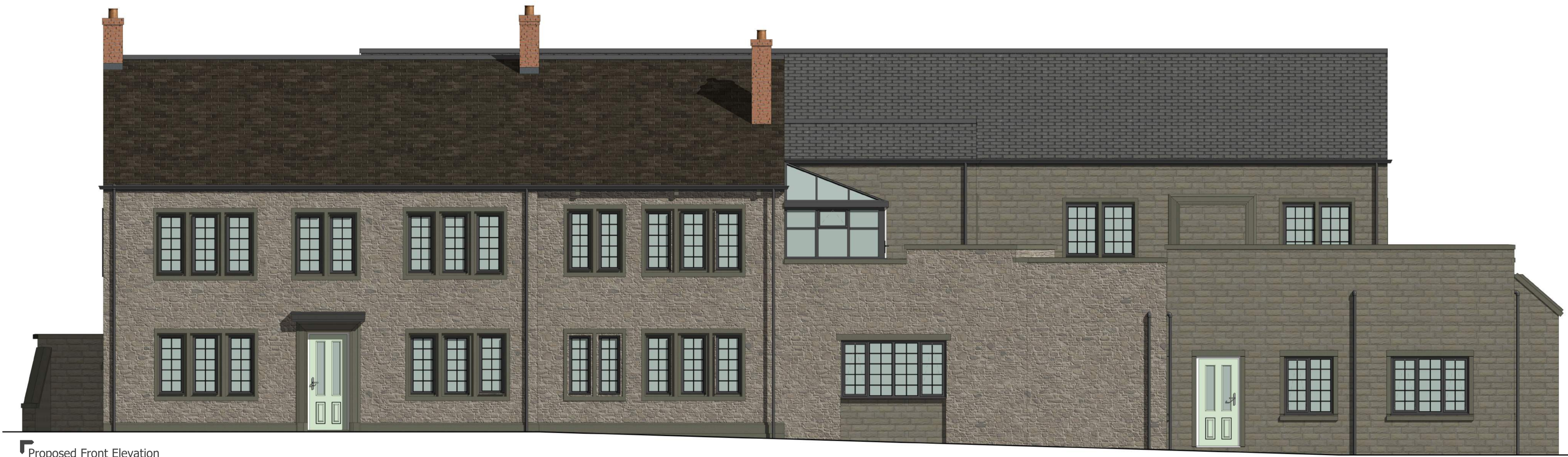
Proposed Front Elevation 1 : 50